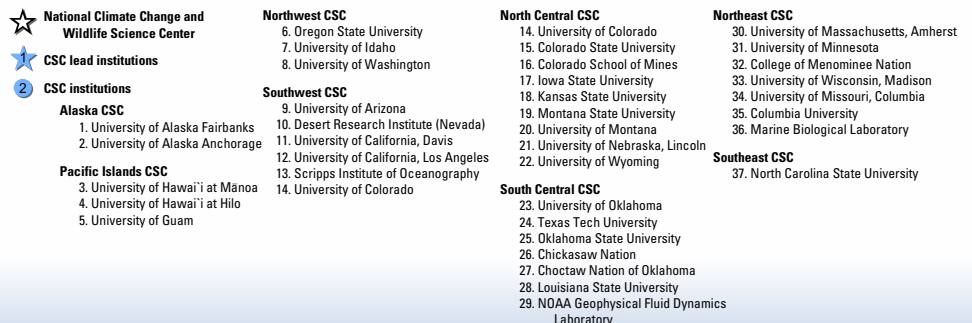
Figure 1. Map showing the locations of the Department of the Interior Climate Science Centers (CSC) and their university-led consortia.