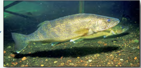
Walleye ( Sander vitreus).