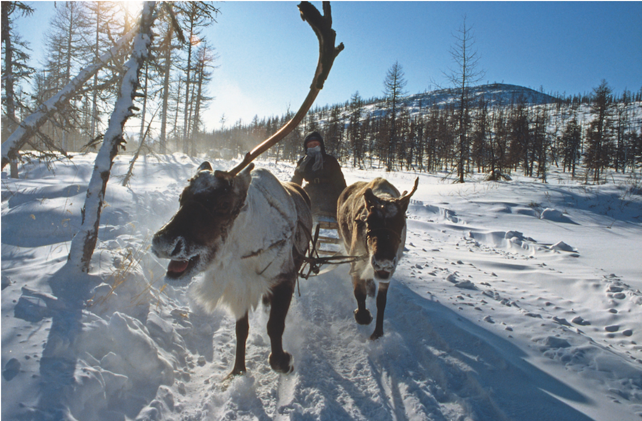
Photo: Evenki woman on the move, Eastern Siberia, Russia, Snowchange. Used with permission.