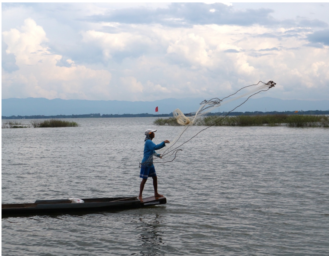
Photo: Fisherman on Lake Phayao, Northern Thailand, Snowchange. Used with permission.

constitute an invaluable input to be considered in the Working Group II contribution to the IPCC Sixth Assessment Report.