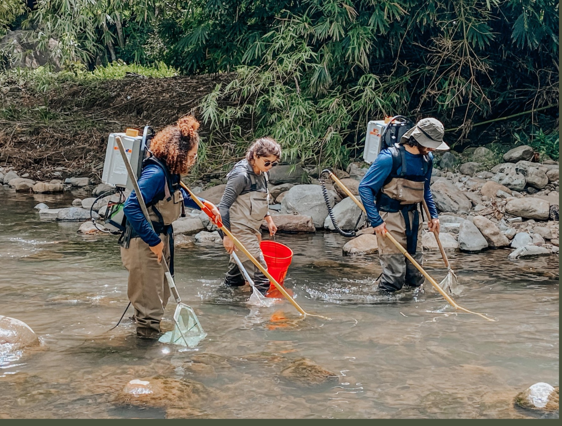
Significant patterns and parasite presence in American Eel distribution in Puerto Rico.