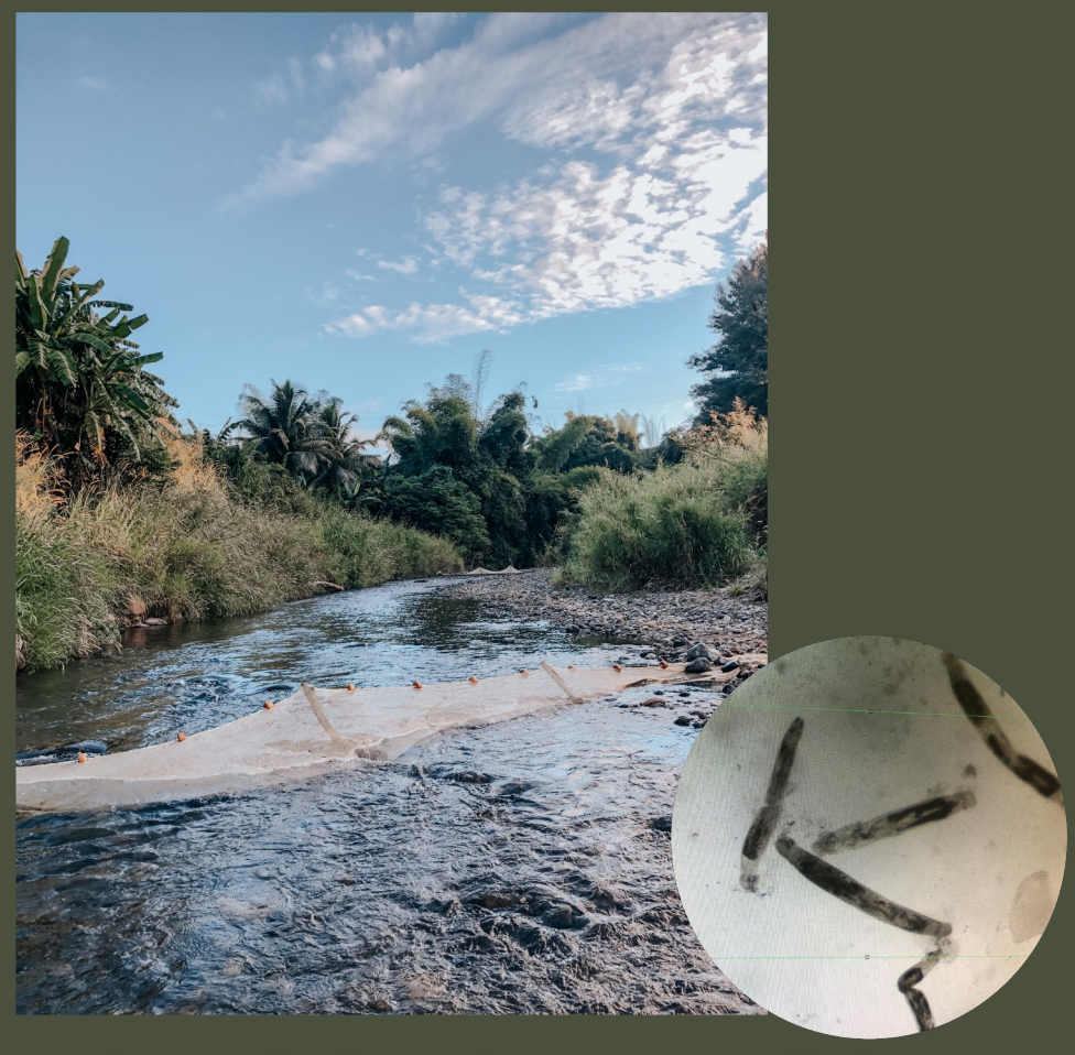
Improve knowledge about overall threats affecting the declining population.