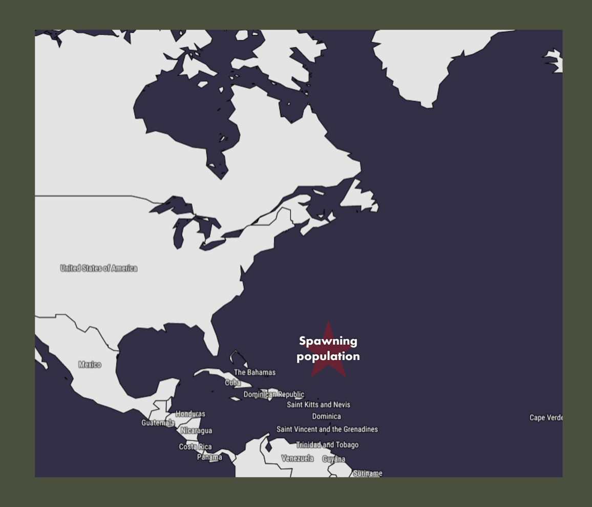
Reproductive potential and contribution to the spawning population.